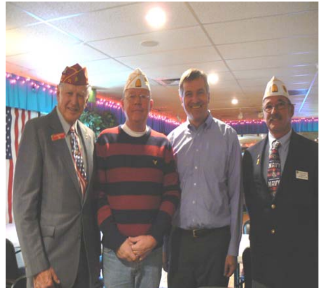
Congressman Matheson drops by Post 71 for chili on Veterans Day. He also went to Post 112 and met with Legion, SAL, and Auxiliary members all over SLC

Veterans Day saw the Army sign Community Covenants with Taylorsville, Sandy and Kearns. The Parade sponsored by the City of Taylorsville was well attended and concluded with a ceremony dedicating its Veteran's Memorial. It was very well received and they continue to build upon it.