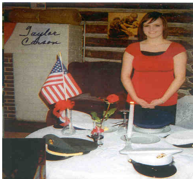
Junior Auxiliary with POW/MIA Table